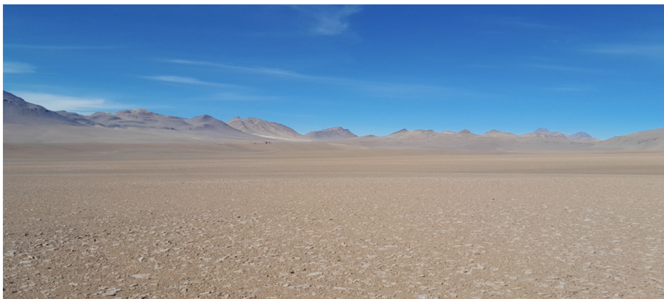
View of the Pampa La Bola site chosen to host SWGO. The site is located within the Atacama Astronomical Park in the Antofagasta Region, Chile, at 4,770 m altitude.